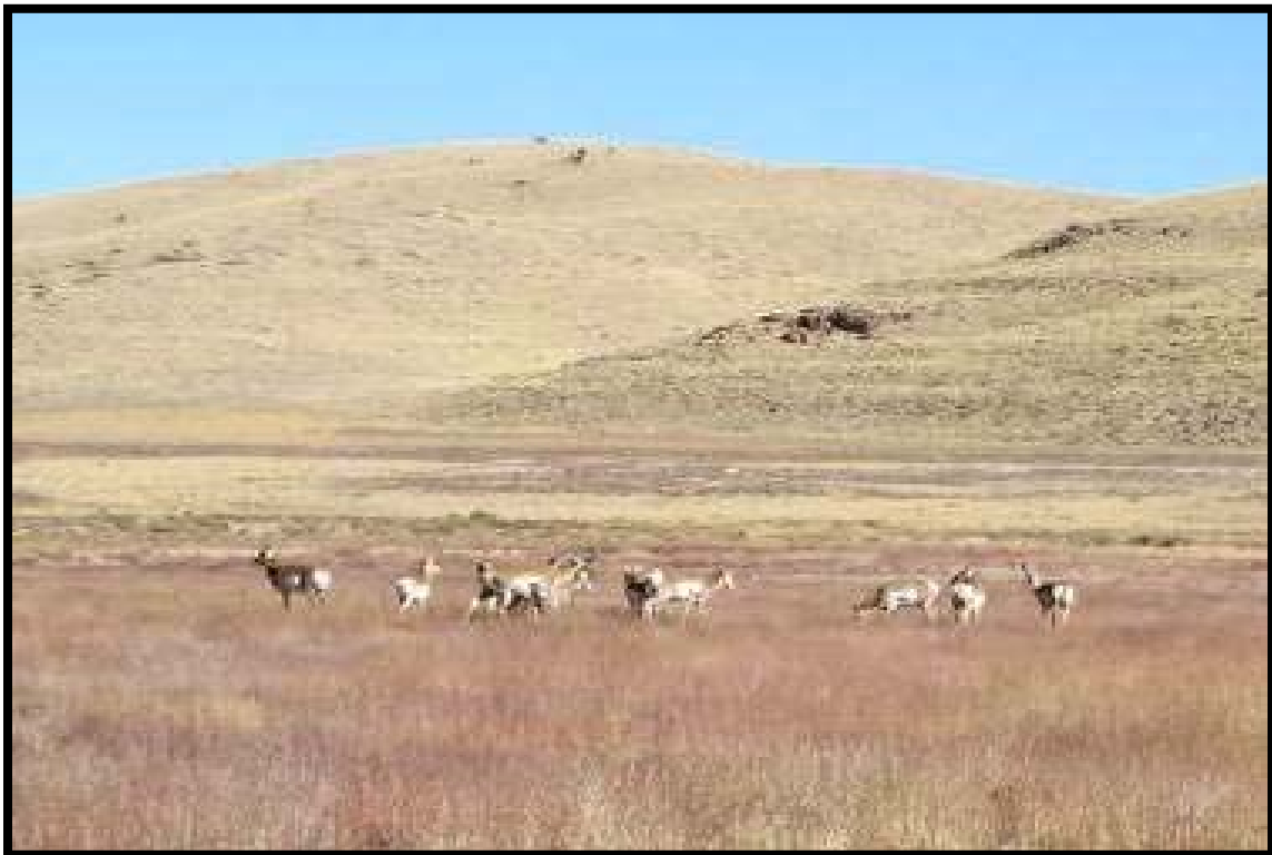
Antelope on a Green Strip Planting of 'Immigrant' Forage Kochia